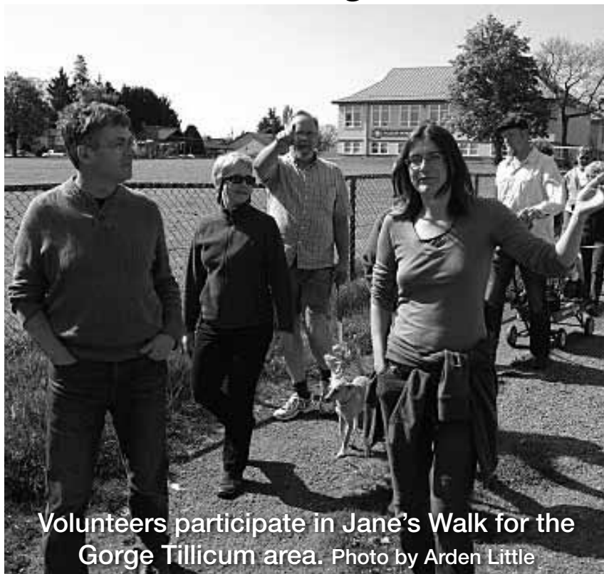
Volunteers participate in Jane's Walk for the Gorge Tillicum area.