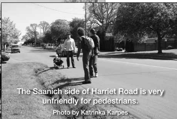
The Saanich side of Harriet Road is very unfriendly for pedestrians.