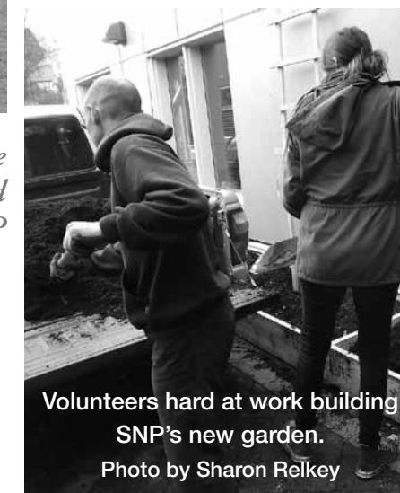
Volunteers hard at work building SNP's new garden.

Community organizations working together make local food happen. As GTUF continues its work with SNP and other local organizations, the sky's the limit. — Sharon Relkey