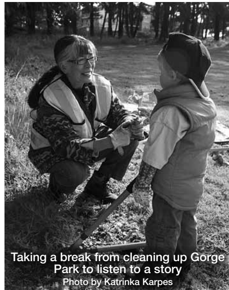
Taking a break from cleaning up Gorge Park to listen to a story