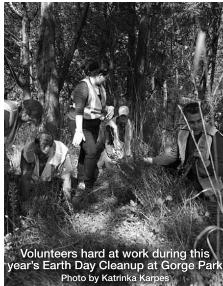
Volunteers hard at work during this year's Earth Day Cleanup at Gorge Park