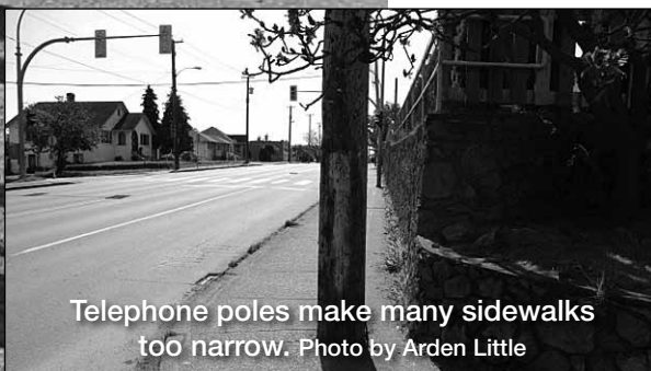
Telephone poles make many sidewalks too narrow.

On Sunday, May 6th about 25 walkers took the streets of the neighbourhood to examine the 'walkability' of our community.