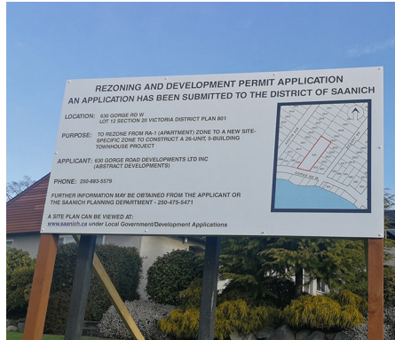
These development signs are put up to advise neighbours about a proposed development at that location.

Concerns are usually about traffic, parking, building height and density