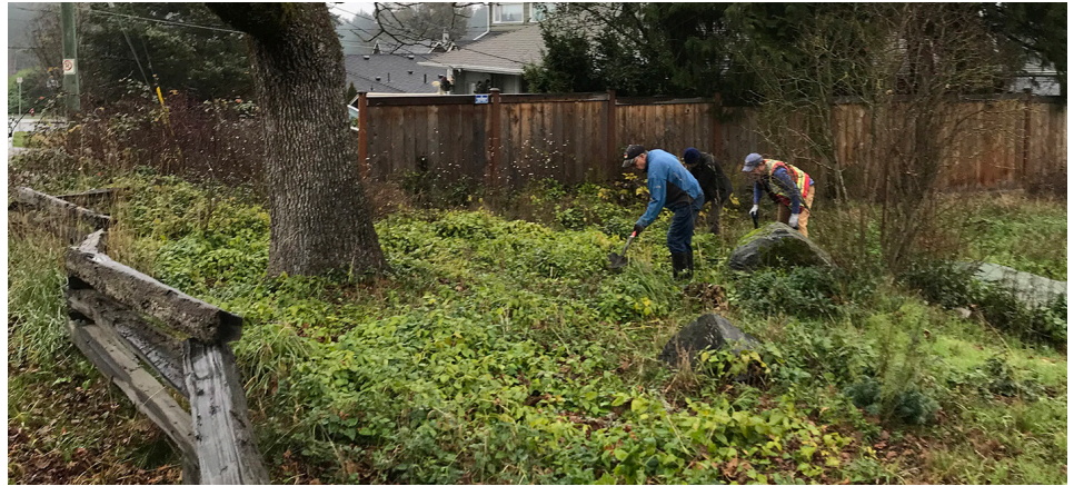
Blue and Green Working Group restoring areas in Walter Park.

Adding native plantings to Walter Park will help restore a small garry oak ecosystem and provide pollinator food sources and habitat. According to the Garry Oak Ecosystem Recovery Team (GOERT), garry oaks once filled the coastal areas of southwest British Columbia and now less than 5% of these ecosystems remain, typically in small patchwork sections. But, we thought, what if restoration work in Walter Park is just a place to start? Native pollinators thrive in stretches of contiguous food sources, i.e., they require linked habitat attractive to their needs. What if homeowners throughout Gorge Tillicum built up our local biodiversity by adding wildlife habitat to their front and back yards? This might include a mix of native plants (woolly sunflowers, bee balm, golden