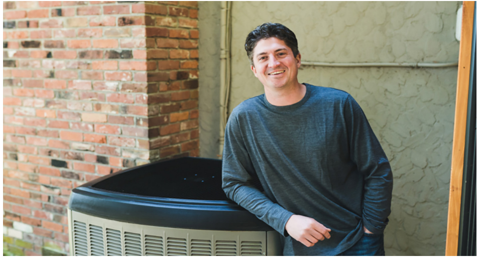
With a heat pump you will have efficient heating in the winter and air conditioning in the summer!

Visit the CleanBC Better Homes website at www.betterhomesbc.ca and learn about the Group Heat Pump Purchase Offer that rewards groups of homeowners working together to